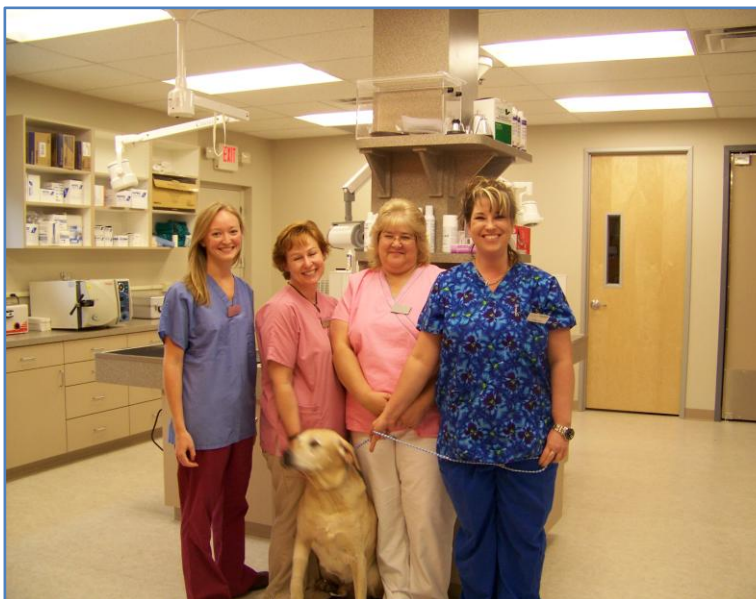
The SWVH Staff is excited to assist you and your pets!

Antech reference laboratory, our in-house IDEXX blood analyzers and making use of the rest of our new equipment.