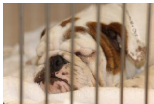
Lola recovering from surgery

Follow up care is crucial for proper healing. SWVH distributes clear oral and written instructions. Ask us if there are any questions!!