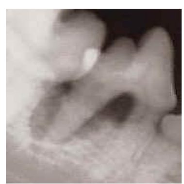
Marked bone loss

Only a portion of a tooth is visible above the gum line. SWVH uses digital dental X-rays to show what we cannot see – the tooth's structure below the gums and the bone that anchors it – and therefore treat appropriately.