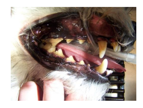
Missy's teeth before professional dental cleaning